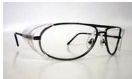
KAV - Aviator™